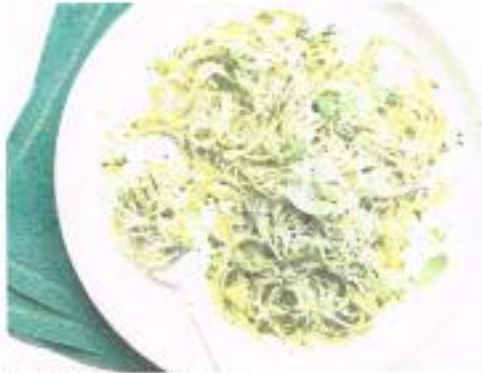
Angel Hair Pasta with Pesto

Total Time: 20 min Prep: 10 min Cook: 10 min