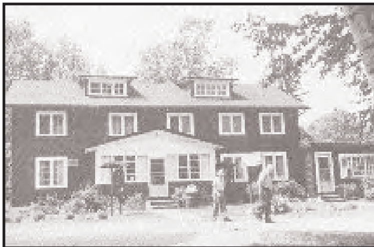
George Burt Education Centre, Port Elgin 1957 Now CAW Family Education Centre

Officially opened on October 1, 1988, the new CAW Family Education Centre was now a year round, 47 acre site. For CAW members and their families as well as others who use the facilities, it is an exceptional environment for reflection, discussion and recreation. I encourage any member who hasn't been there to take the opportunity to visit the facility and discover how important education is to the CAW.