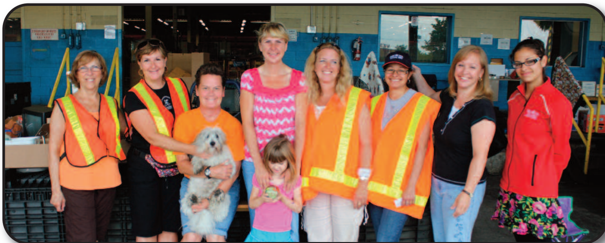
Womens Committee White Elephant Sale

Any suggestions for any of these events please see someone on your women's committee