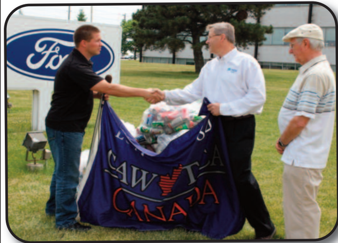
Habitat for Humanity Can Donation