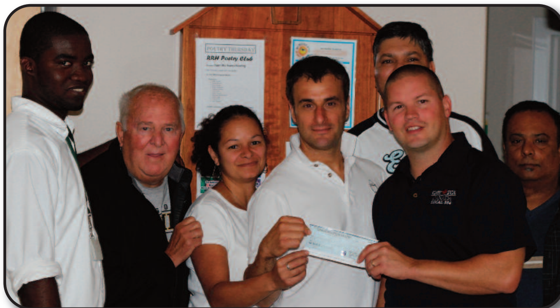
St. Leonards mens shelter donation.