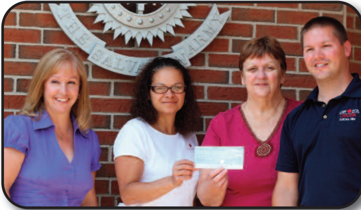
Salvation Army Womens Shelter Donation