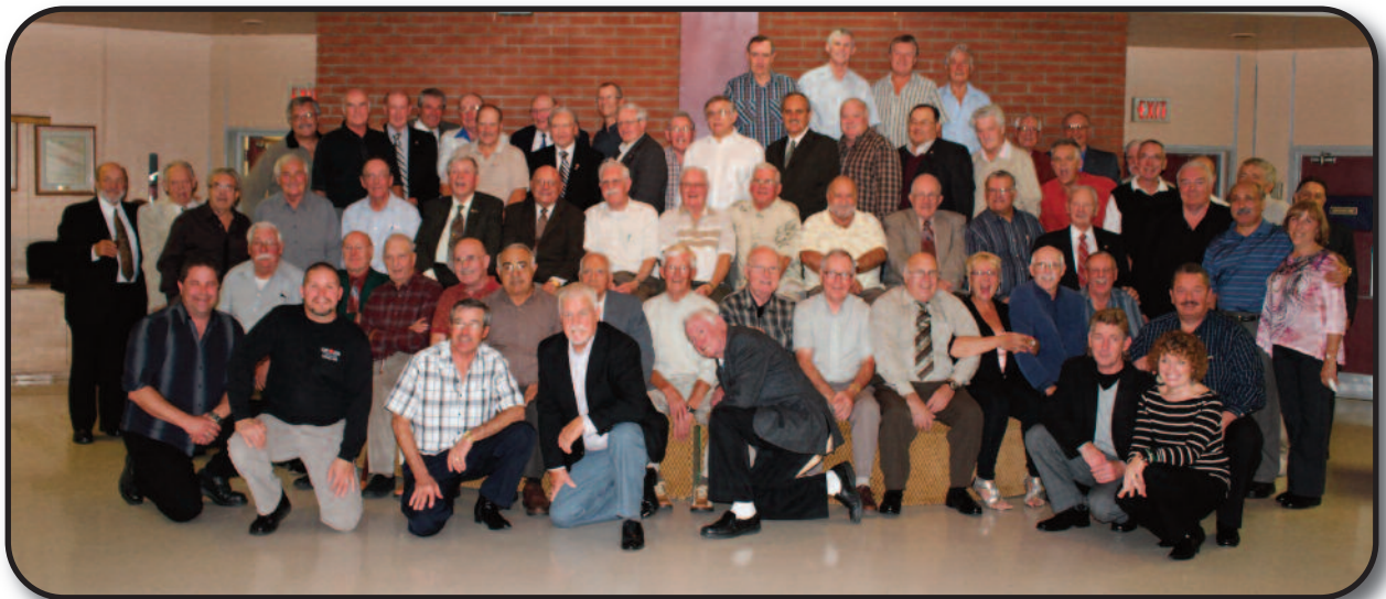
Annual Retirees Luncheon