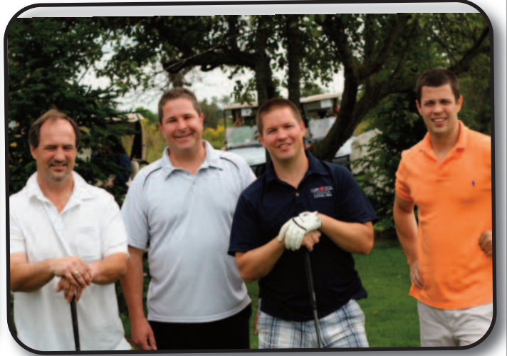
2nd Annual 584 Charity Golf Classic