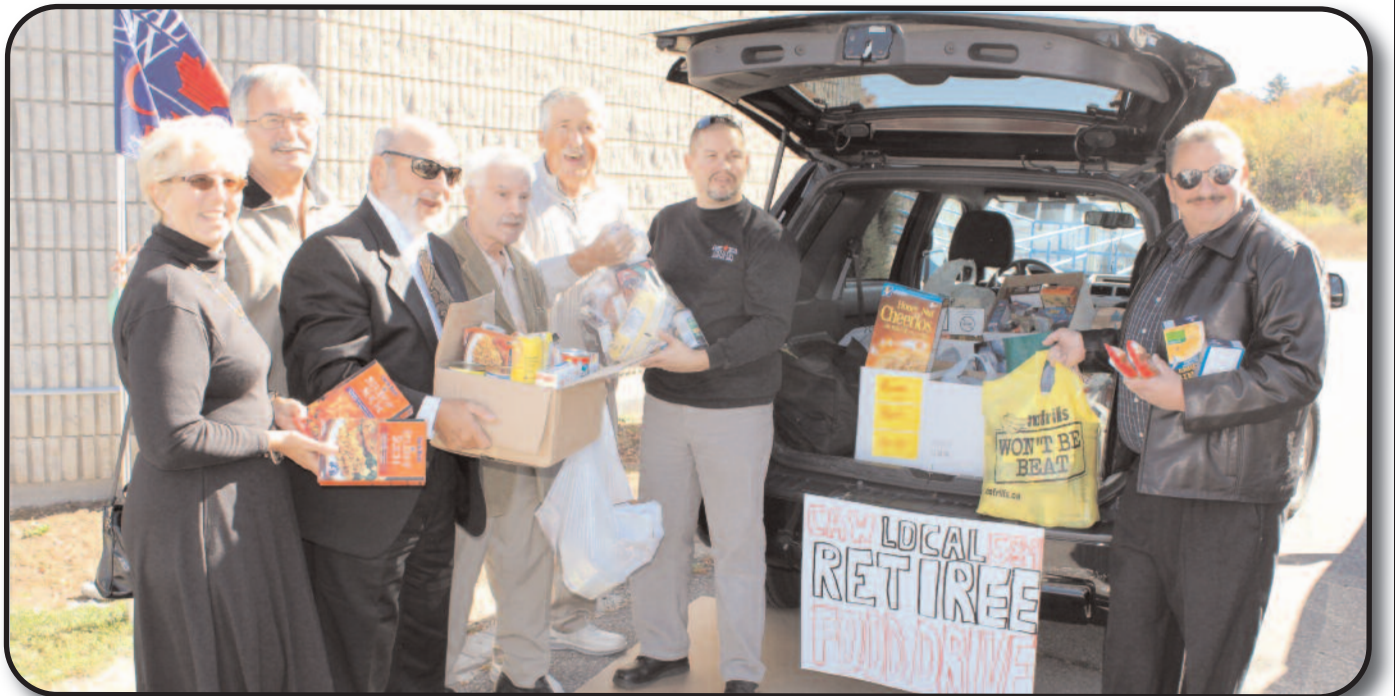
CAW Local 584 Retiree Food Drive