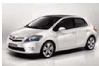
Toyota Auris HSD

Peugeot is planning to launch the iON electric city car late next year. A version of the Mitsubishi iMiEV, the iON uses lithium-ion batteries to power an electric motor that has a range of 80 miles after a six-hour charge from the household mains. An 80 per cent charge can be achieved in 30 minutes using a fast-charge system.