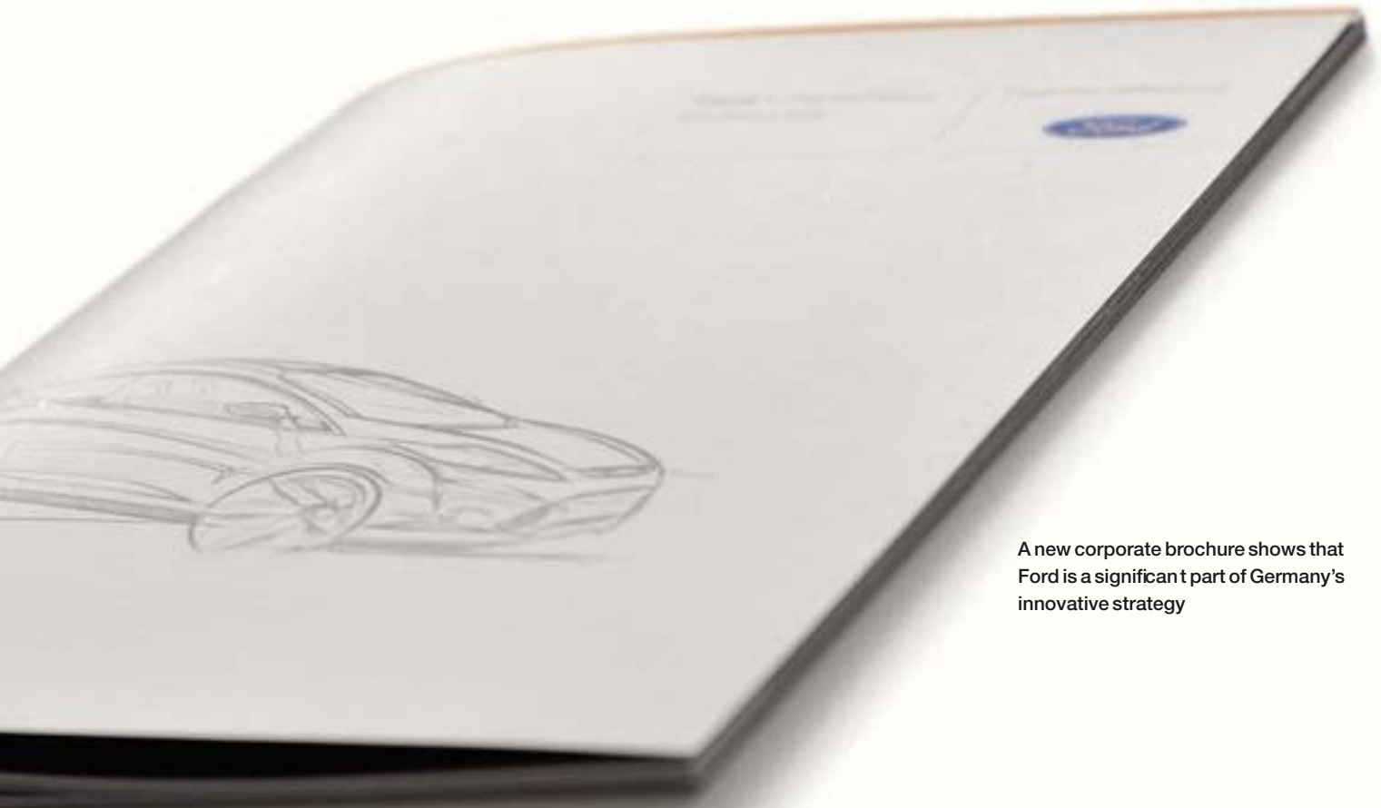
A new corporate brochure shows that Ford is a significant part of Germany's innovative strategy