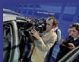
Capturing the excitement of the Ford display in Frankfurt

Frankfurt showed, above all, that Ford's product revolution is continuing, with two new C-MAX models grabbing the spotlight on the Company's stand. The five- and seven-seat duo introduced a number of advanced technologies new to the compact MAV class. These focused on enhanced comfort, safety and sustainability and included the availability of new EcoBoost petrol engines.