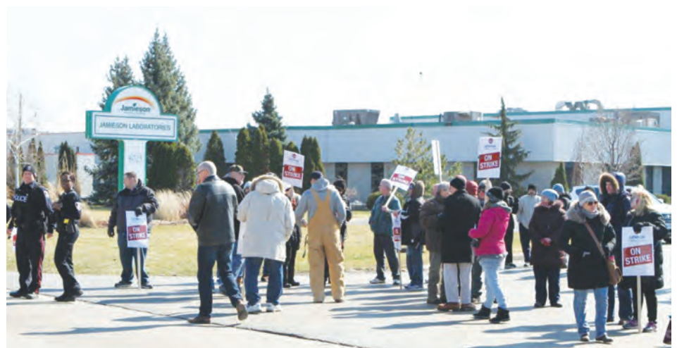
Local 195 members of Jamieson Laboratories hit the picket line and ratified their new 3-year agreement