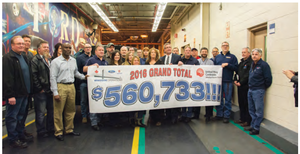
Another proud moment from members of Local 200 who continue to give back to the community year after year, knowing the importance and the good work that the United Way does.