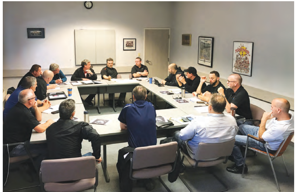
Local 444 Local Officers along with the Windsor Assembly Plant Committee and Representatives are seen recently meeting at the union hall pertaining to the FCAT Transportation Department.