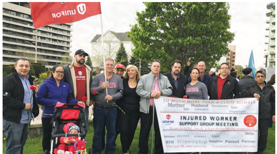
Seen are proud members from Local 195 recognizing and paying respect on the National Day of Mourning at Coventry Gardens in Pillette Village.

Our members ratified a new 4 year agreement on Sunday April 30th, ... cont'd on next page