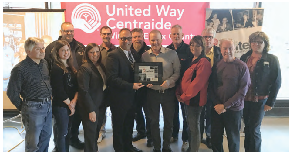
At a special event kicking off the upcoming 70 Year United Way celebration, Locals 200 and 240 were recognized for their ongoing support towards the community.