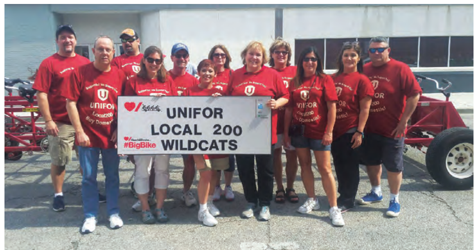
Seen are Unifor Local 200 Wildcats members joining in for the Heart and Stroke Foundation's Big Bike Ride which helps raises funds to improve the lives of every Canadian touched by heart disease or stroke.