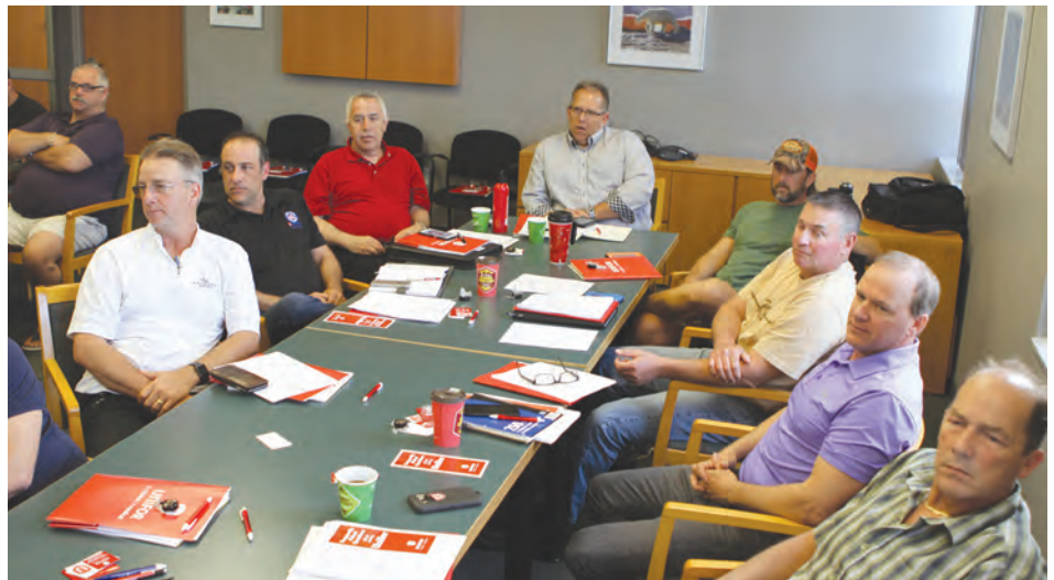
Local Leadership and National Representatives from the Windsor, Chatham and Sarnia areas are being updated on current campaigns within Ontario from the Ontario Regional Council.