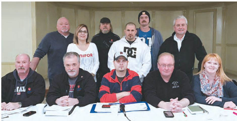
Seen are bargaining members from Local 240 and Local 1959 from the recent bargaining at the Ojibway salt mines.

In closing, it looks like a 2017 will be a busy year within the local.