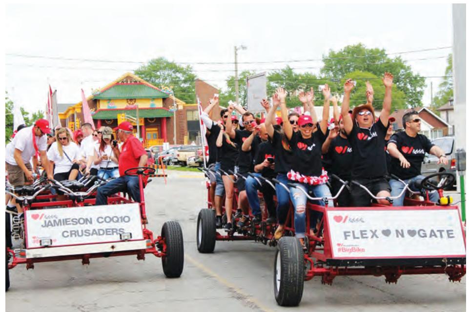
Seen are Unifor Local 195 members joining in for the Heart and Stroke Foundation's Big Bike Ride which helps raise funds to improve the lives of every Canadian touched by heart disease or stroke.