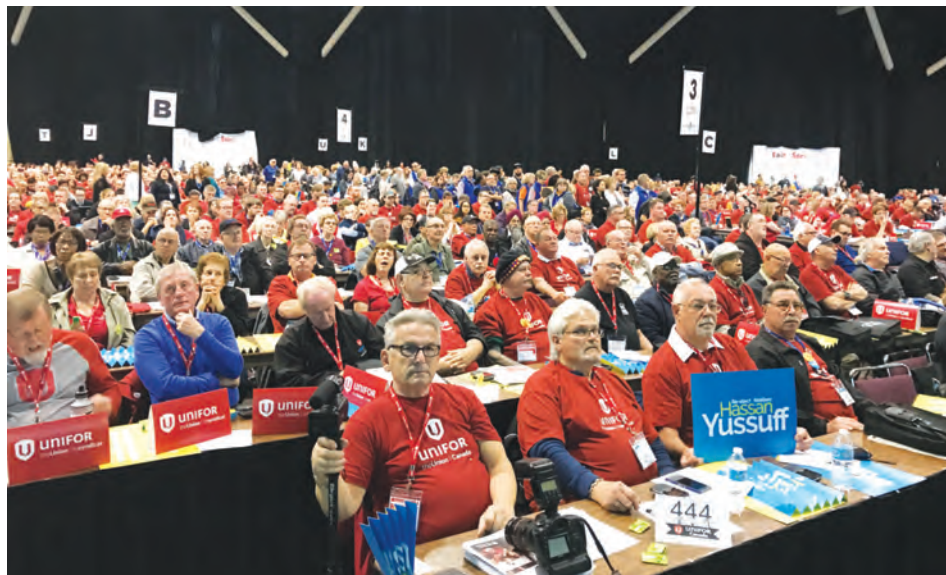
Seen are area retirees from various Unifor local unions within Essex County partaking in the recent elections at the CLC Convention held in Toronto.