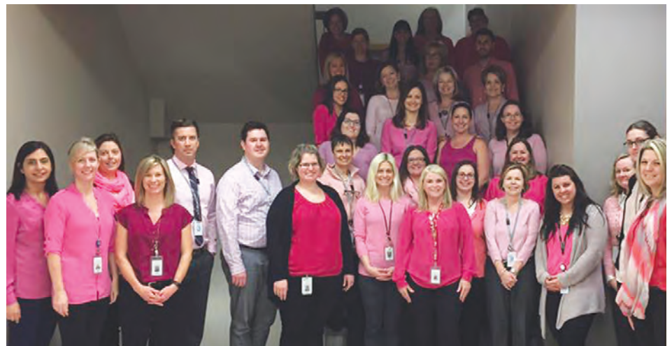
Members of Local 240 employed at Green Shield wear pink, taking a moment for a photo recognizing that "bullying must stop" in our schools, workplaces, homes and over the internet.