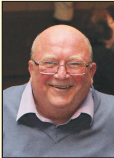
May 23, 1948 - May 24, 2017