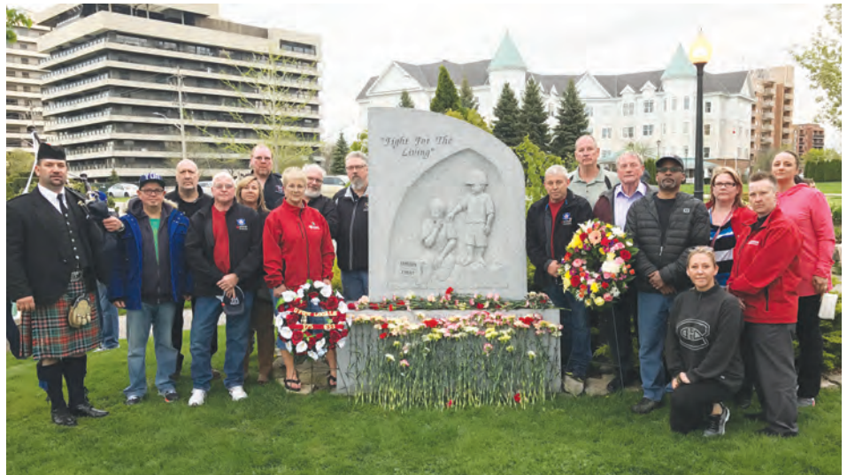
On April 28th the National Day of Mourning and recognizing injured workers and those who have been killed on the job, proud Local 444 members take a moment for a photo at the Workers Monument at Coventry Gardens in Windsor.

All in all, the Changing Workplaces Review has been a real process for the Government to undertake, I look forward to the debates that will surely come around this issue and ultimately, seeing the recommendations implemented. A full report has not yet been made public so we only know of a few of the changes that have been announced, this too will be interesting to see what else comes of this review process.