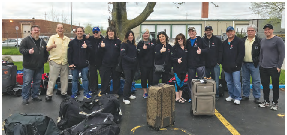
Proud Local 200 members are seen before they board the bus to Africa to help those in need.

On a final note, with the vacation season fast approaching, please make sure you take some time away from the job to do whatever it is you like to do, with whomever you like to do it with! What can be more important than that?