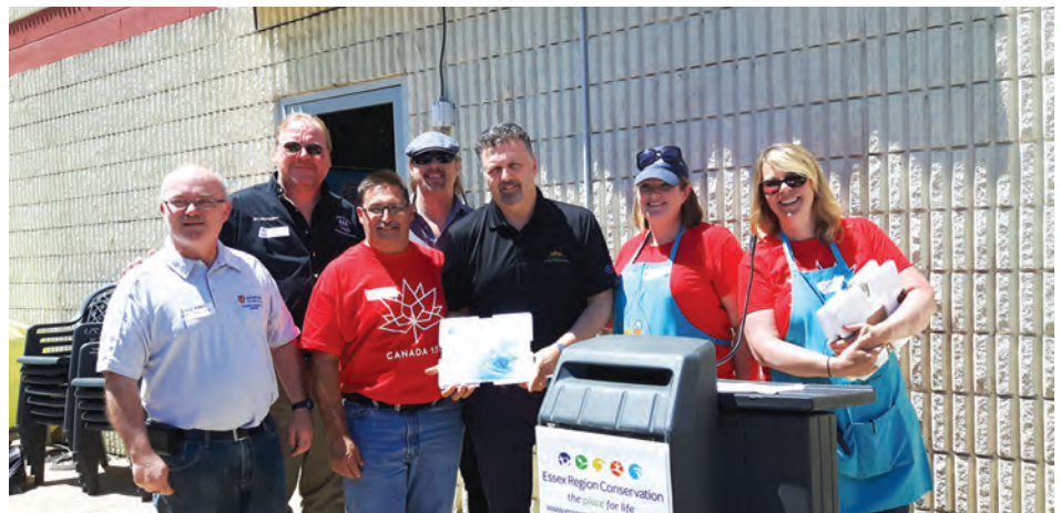
Unifor Local 444 Environment Committee participates annually by providing one of the more than 50 hands-on events that will help to educate over 3,900 students this year alone. This is the 14th year for the Essex Children's Waterfest educating more than 48,000 since inception for our community.