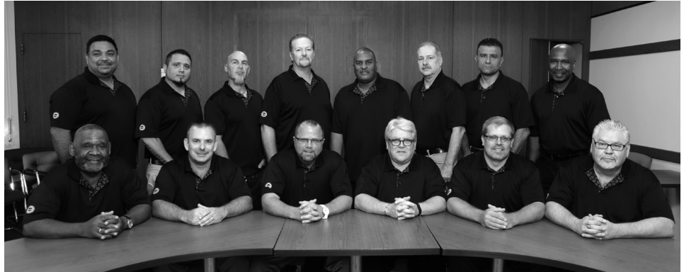
The 2015 UAW-Ford National Negotiating Committee